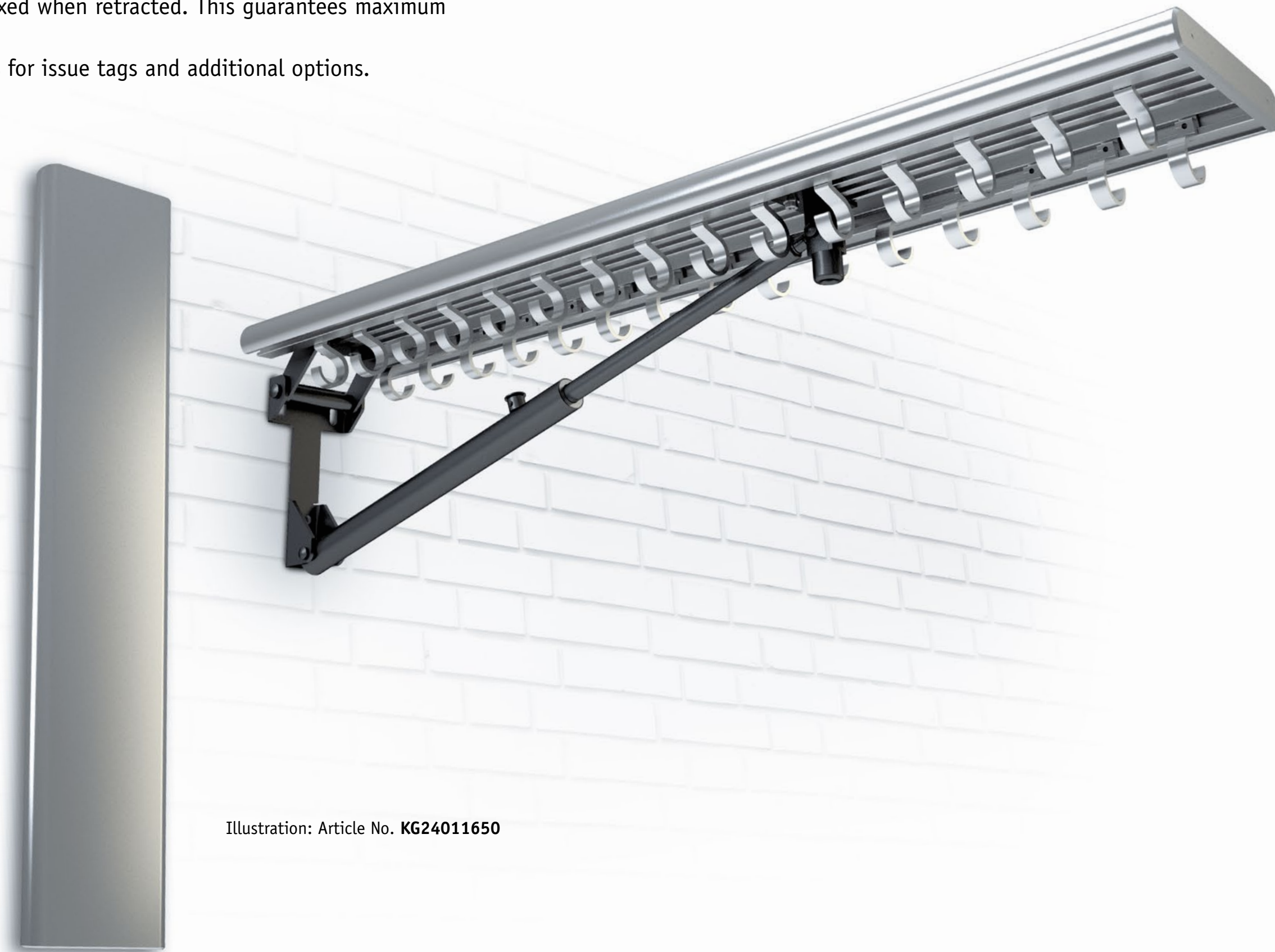
Illustration: Article No. KG24011650

See accessories for issue tags and additional options.